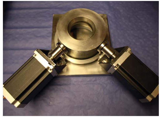
Fig. 2. Complete retrofit kit (mounted on a base plate) for an existing blown film die. With the aid of two stepping motors, the required position of the die with respect to the mandrel can be adjusted with maximum precision