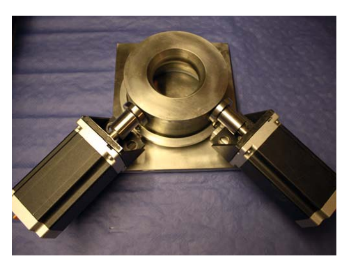
Fig. 1. Exhibition model for demonstrating the benefits of tiling die technology. The four flange bolts are used not only for clamping purposes, but also to tilt the die