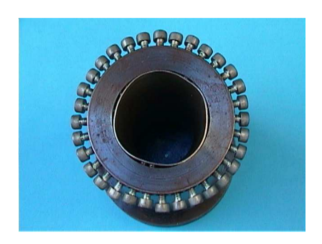
Fig. 1 Cross sectional drawing of a flex ring die (right side) and Photo of an outer ring with an integrated flex ring sleeve (left side)

It is naturally not appropriate to carry out dynamic adjustment at 32 setting positions in a production plant. The tool in Fig. 1 is a pilot tool. It permits to determine the optimum flow-channel contour for a new product rapidly and inexpensively during die design. By purely static adjustment, the appropriate profiling of the flow channel gap around the circumference of the die can be determined for each position along the length of the parison. The geometry can thus be optimised after each shot to obtain the desired result.