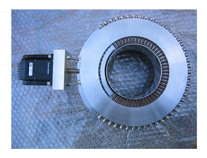
Fig. 2 Originally static test die which was retrofitted with an adjusting drive to perform first dynamic tests

However such a die which was originally designed for a purely static adjustment can be easily converted into a dynamically controlled production die (Fig. 2). In a partial region the setting screws were removed and are replaced by a linear actuating motor. The linearly moving axis is securely connected to an adjustment jaw to locally deform the flex ring sleeve over a relatively large circumferencial area. The adjustment jaw has distributed across the width, 14 small grub screws (Fig. 3), with whose help the geometry of the jaw can be easily adapted to the requirements of the product.