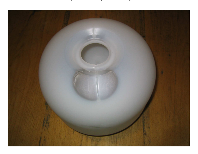
Fig. 4 Blow moulded bottle with extreme thin area which has been generated for the purposes of demonstration by short term local closure of the flow channel gap on the die by means of the setting jaw

Because of the small mass that has to be accelerated with this system, positioning movements can be executed very rapidly. To demonstrate what is possible with the flex ring technology, in a test run, the flowchannel gap was closed at one point by means of the actuating motor for 0,3 s during the extraction of the parison. A position was chosen at which the container produced by a conventional die always had an undesirable thick wall. The result of the test carried out on an accumulator head die is shown in Fig 4. A purely visual comparison of the generated thin area with the wall thickness at the corresponding opposite position makes clear what severe wall-thickness changes are possible with a flex ring die. The short transition region at the edge of the generated thin area cannot be achieved in this way with any other system.