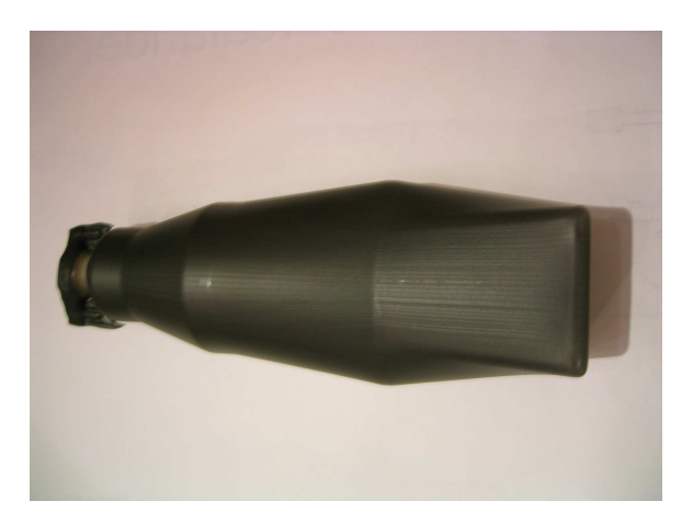
Fig. 6 Special designed bottle with varying cross-sectional geometries manufactured with the test die

Additionally, a test bottle was designed with three different zones for research purposes. The geometry changed over the length of the bottle from a rectangular base region via an oval lower bottle zone to a circular geometry (Fig. 6) in the upper region of the bottle [2].