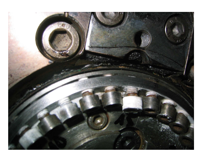
Fig. 8 Cutaway view of a flex ring mandrel that has been retrofitted to a programmable wall-thickness control (PWDS) die for rapid optimisation of the mandrel contour

There is thus no risk of removing too much material at a particular region, and in the worst case of having to start from scratch again. With a flex ring mandrel, every change that has not brought about the desired positive result can be very easily reversed in the next step by unscrewing the corresponding screws.