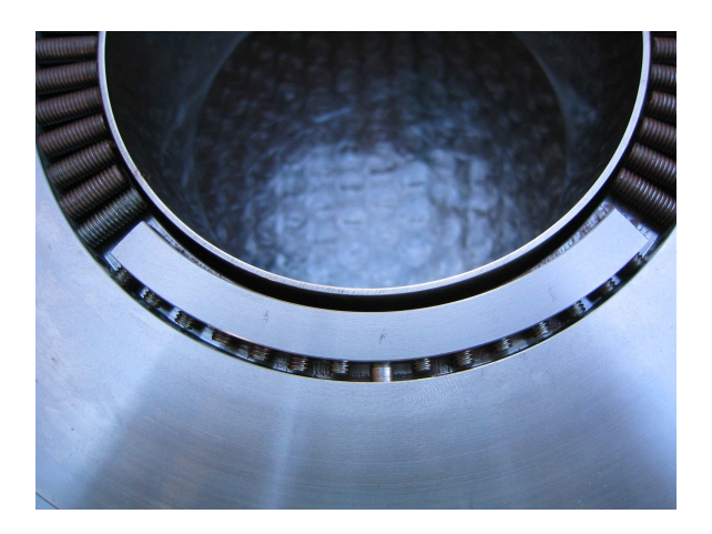
Fig. 3 Adjustment jaw with integrated grub screws for fine setting of the active setting jaw contour

Because of the small mass that has to be accelerated with this system, positioning movements can be executed very rapidly. To demonstrate what is possible with the flex ring technology, in a test run, the flowchannel gap was closed at one point by means of the actuating motor for 0,3 s during the extraction of the parison. A position was chosen at which the container produced by a conventional die always had an undesirable thick wall. The result of the test carried out on an accumulator head die is shown in Fig 4. A purely visual comparison of the generated thin area with the wall thickness at the corresponding opposite position makes clear what severe wall-thickness changes are possible with a flex ring die. The short transition region at the edge of the generated thin area cannot be achieved in this way with any other system.